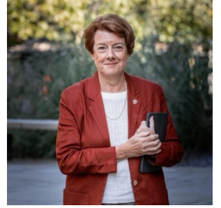
Baroness Sally Morgan

Sally serves on the Cambridge University Council. She sits on the advisory board of the Centre for Science and Policy and the boards of the Bennett Institute of Public Policy.